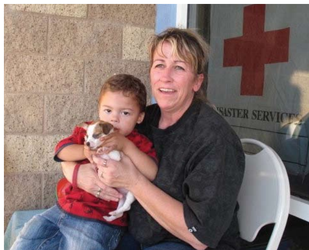
A mother and her son wait at the Marie Kerr Park Red Cross shelter in Palmdale during the Station Fire.

By the time the final shelter closed, the Red Cross provided 700 overnight stays at shelters, 5,700 meals, 530 comfort kits and 50 clean-up kits. Nearly 500 Red Cross volunteers from throughout California assisted with the wildfire relief efforts.